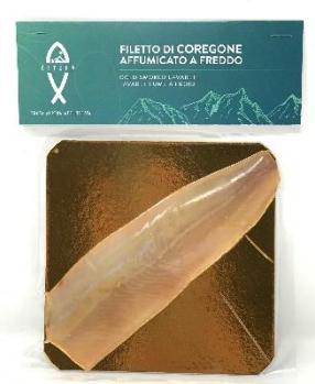
Cold smoked lavaret