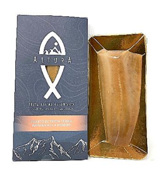
Cold smoked rainbow trout