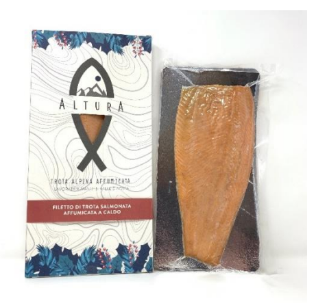
Hot smoked salmon trout