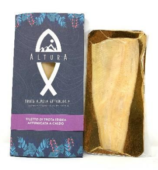
Hot smoked rainbow trout