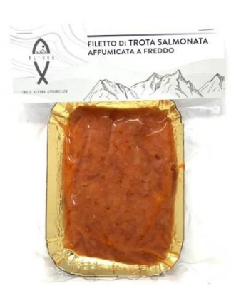
Cold smoked salmon trout tartare