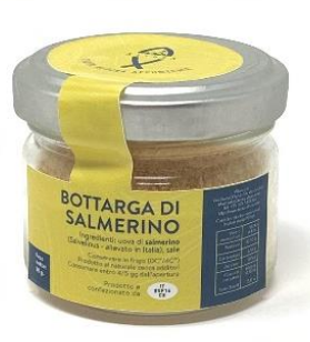
Brook trout bottarga