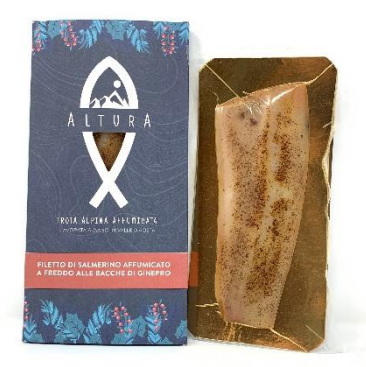
Cold smoked brook trout with juniper berries