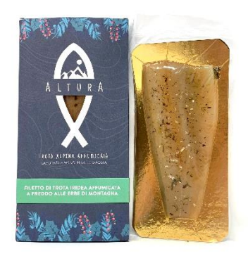
Cold smoked rainbow trout with alpine herbs