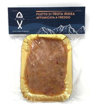
Cold smoked rainbow trout tartare