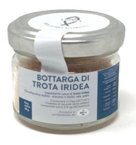
Rainbow trout bottarga