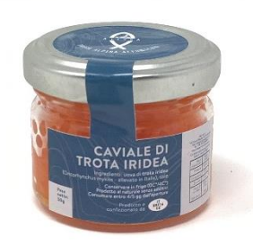
Rainbow trout caviar