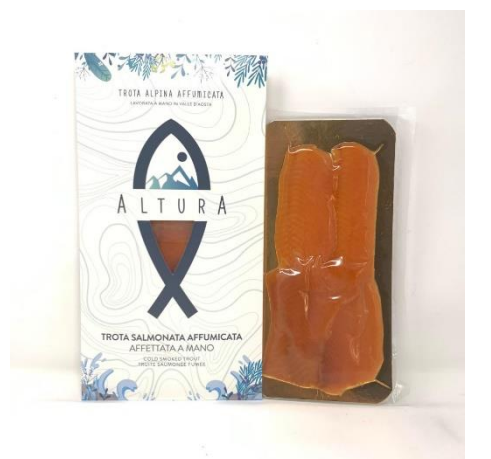
Pre-sliced cold smoked salmon trout