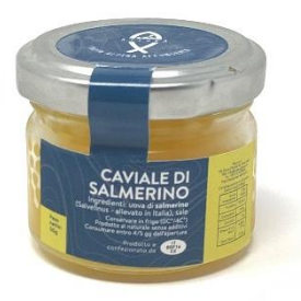
Brook trout caviar