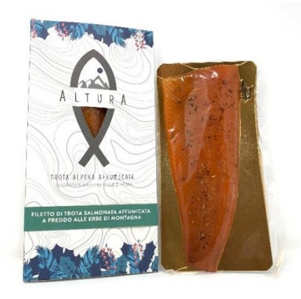
Cold smoked salmon trout with alpine herbs