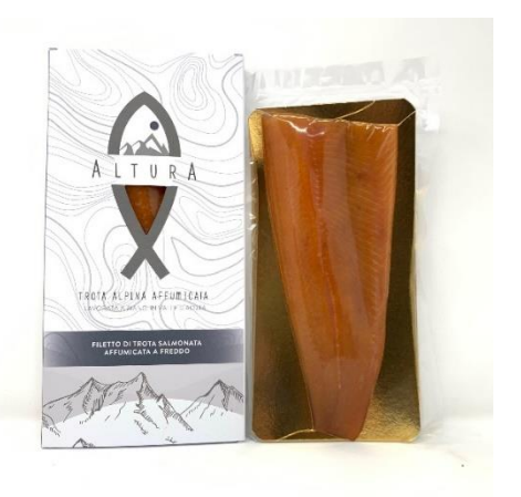
Cold smoked salmon trout